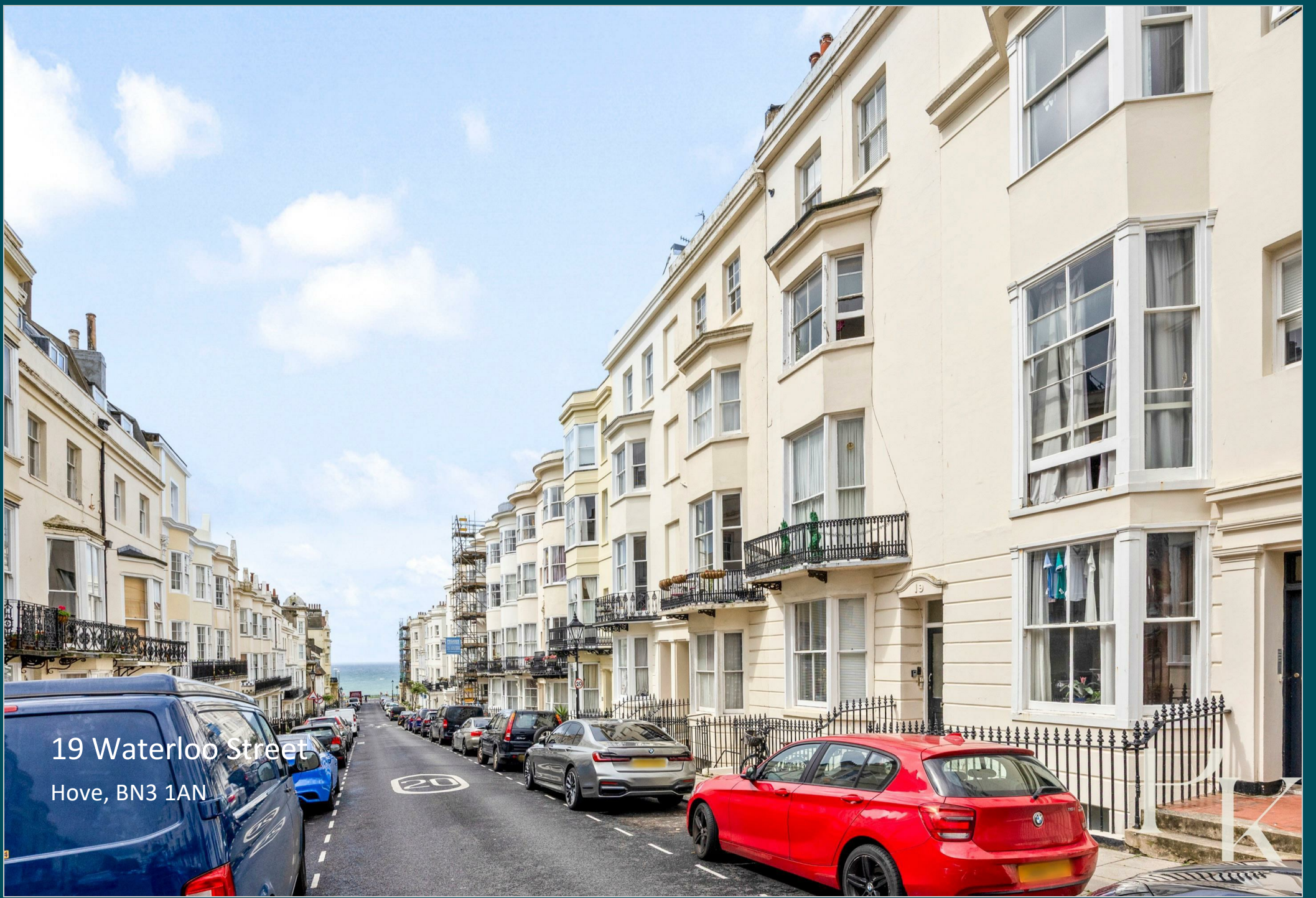
19 Waterloo Street Hove, BN3 1AN